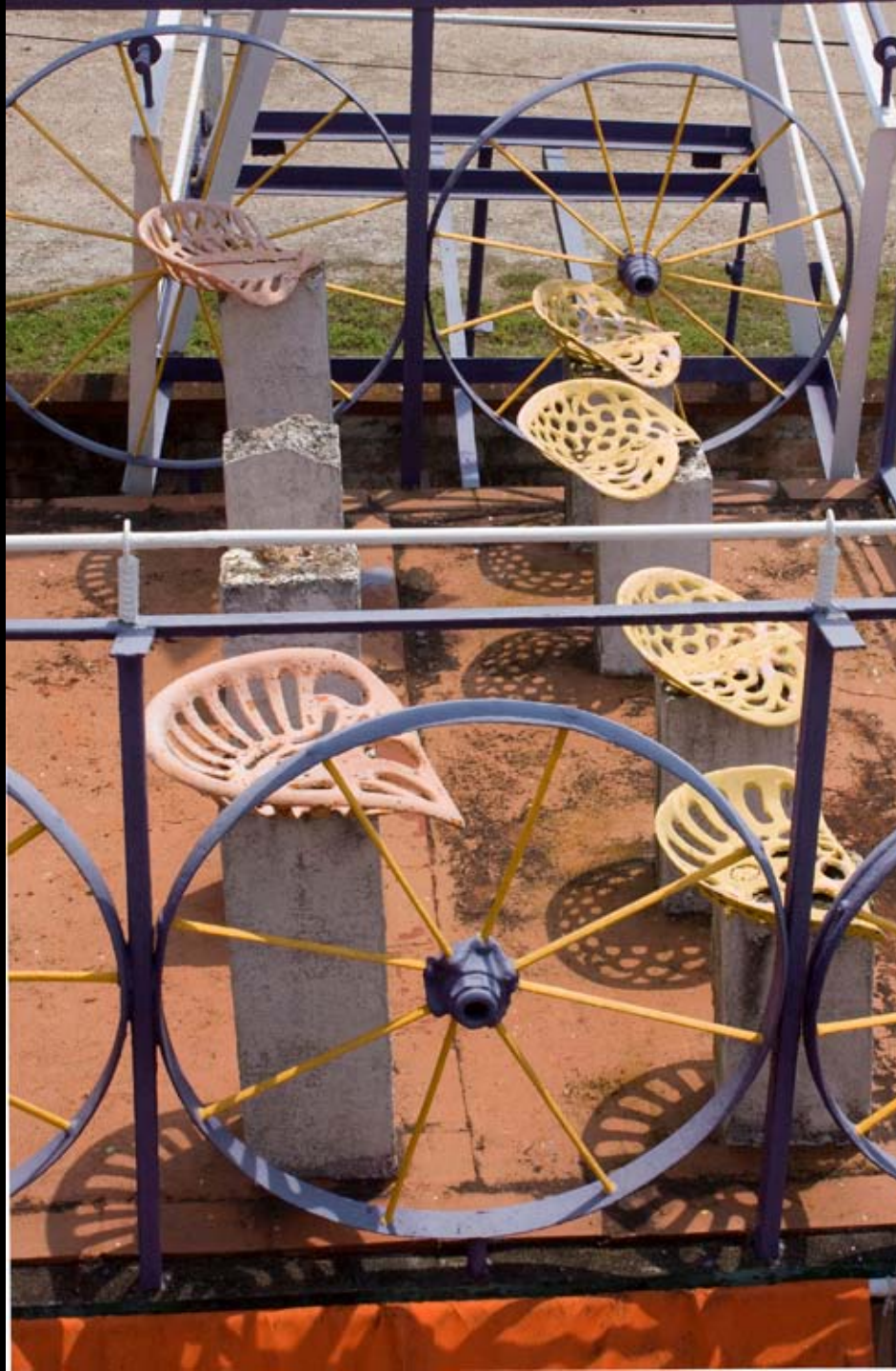
Tractor Seat Auditorium!