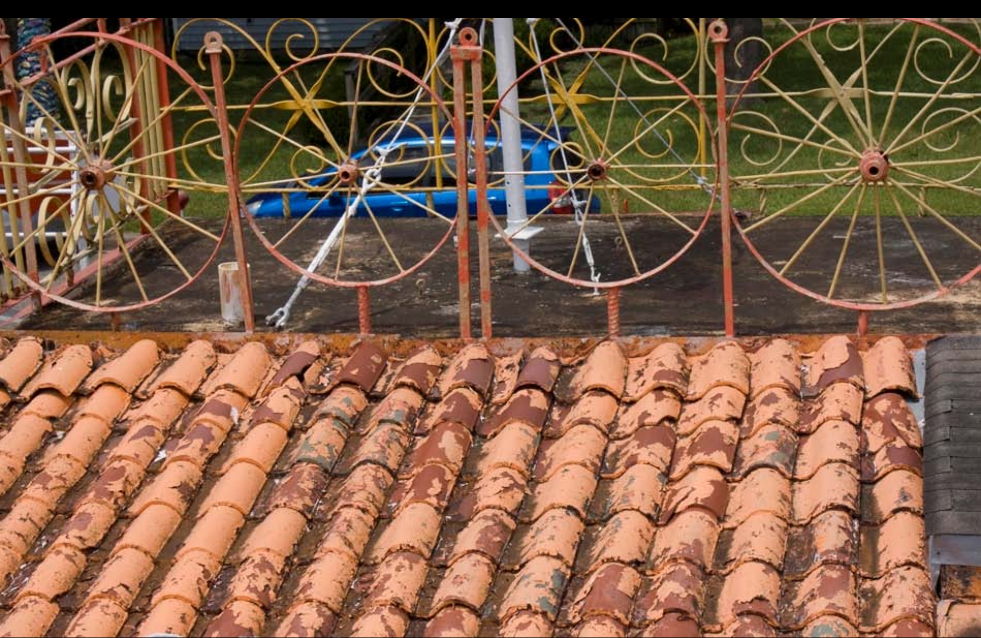
The little blue Honda Fit in the background was the Rassenfoss's and mine chariot to the Hotter Than Hell Festival!