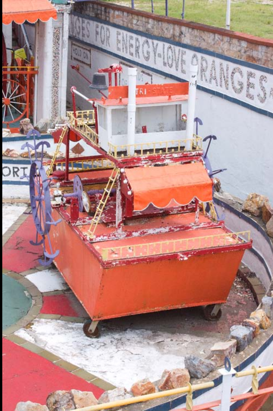
Steamboat Coming 'Round De Bend