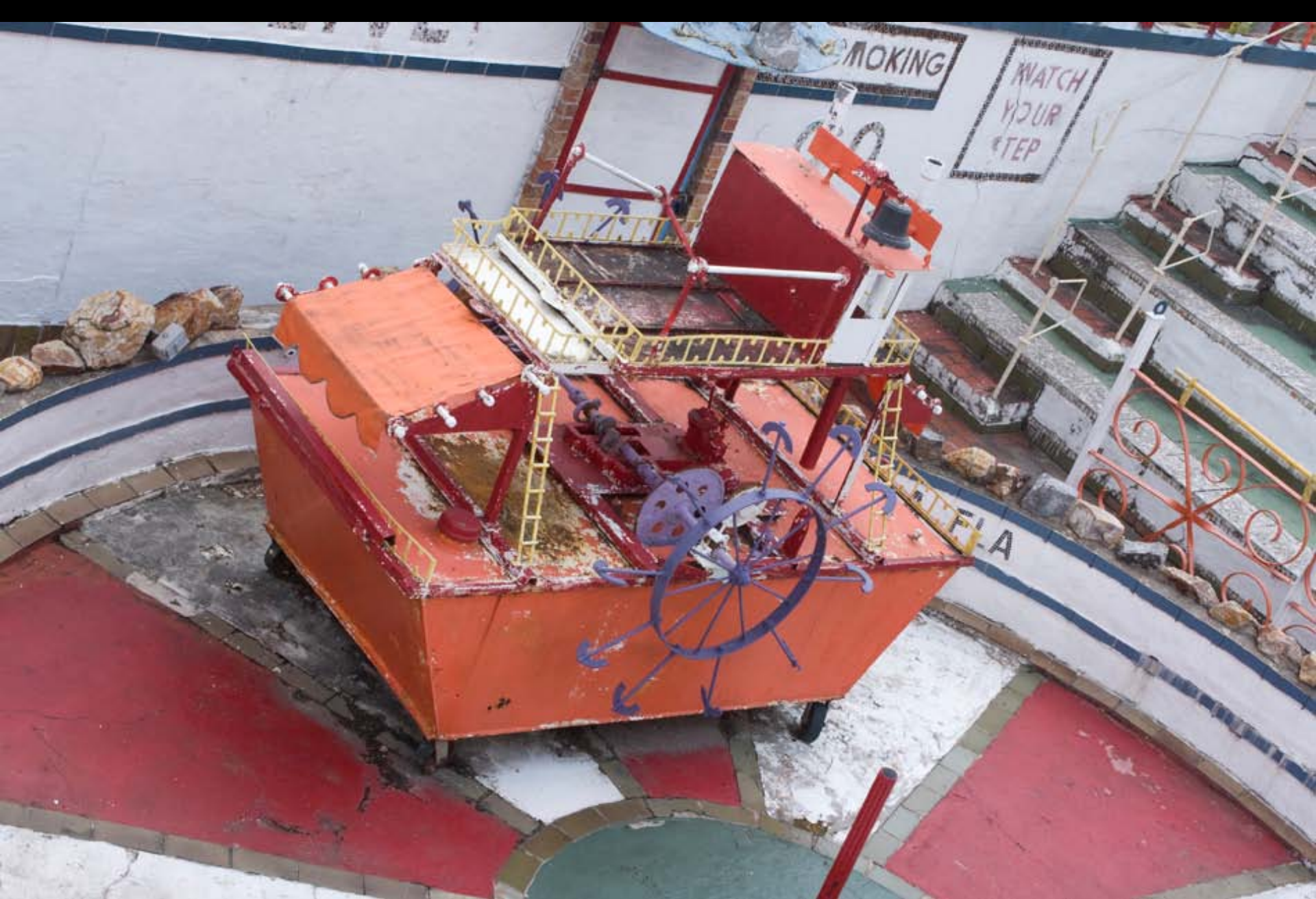
Steamboat in a Roulette Wheel Pond